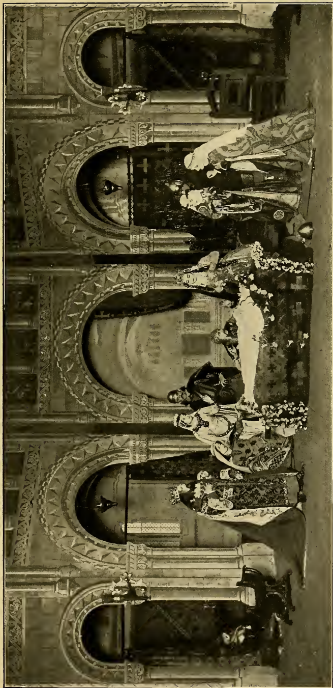
THERE, ON THE PENDENT BOUGHS HER CORONET WEEDS CLAMBERING TO HANG, AN ENVOUS SLIVER BROKE; WHEN DOWN HER WEEDY TROPHIES AND HERSELF FELL IN THE WEeping BROOK."